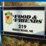
Community service at Food & Friends, Washington, D.C.