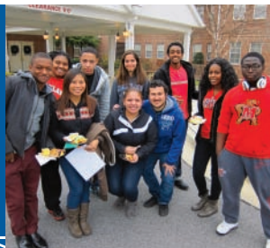
*Community service at Hillhaven Assisted Living Nursing & Rehabilitation Center, Adelphi, Md.