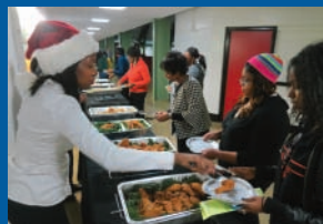
IAP holiday party