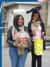
* Community service at the YMCA in Silver Spring, Md. (Preschool Halloween costume parade)