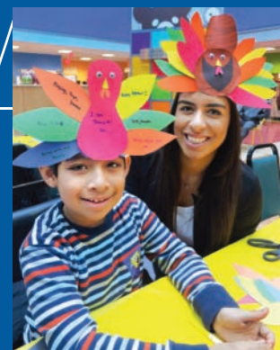
* Community service at Children's National Medical Center, Washington, D.C. (Thanksgiving arts and crafts)