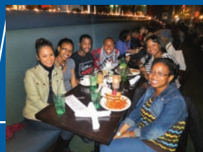
*Open mic at Busboys and Poets